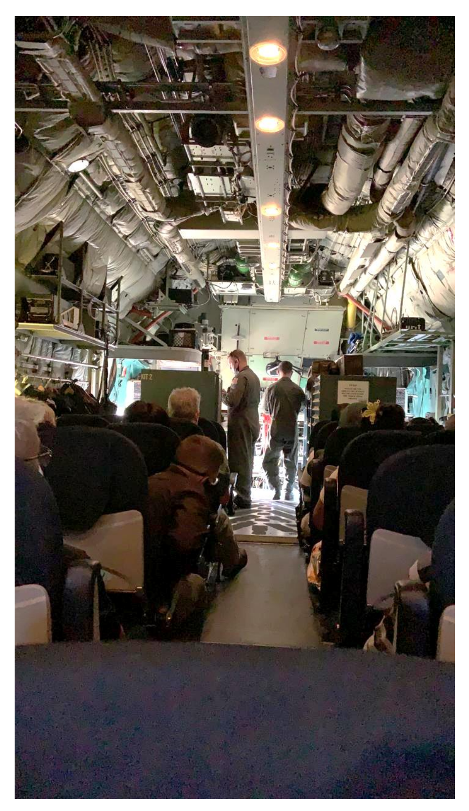
Pictured Above: FSM citizens prepare for their flight home after being stranded abroad for an average period of approximately fourteen months