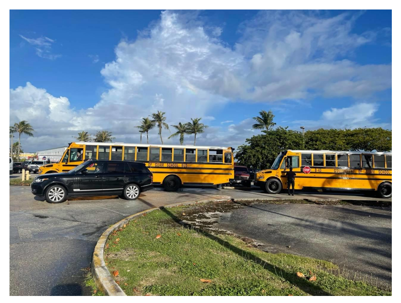
Pictured Above: Sanitized school buses, under escort, safely bring the stranded citizens to the aircraft